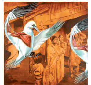
Title: The myth of Jatayu. Site: http://galleries.absolutearts.com/galleries/artwork/bachhawat2us/bachhawat2us1207767568.jpg